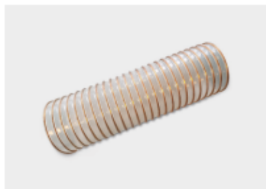
Suction hoses Ø 70 / 100 mm, each 15 m long