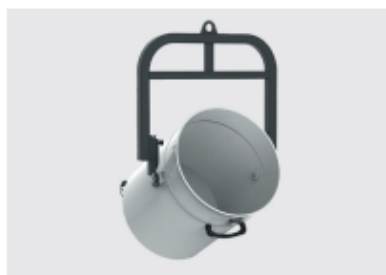
Lifting support to empty the collection bin of the MG3