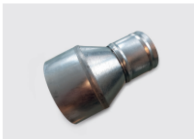
Connectors / reducers Ø 100 mm to 100 / 70 mm